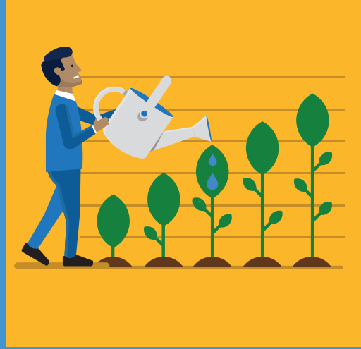
Start and grow easily

Connect your people and processes like never before