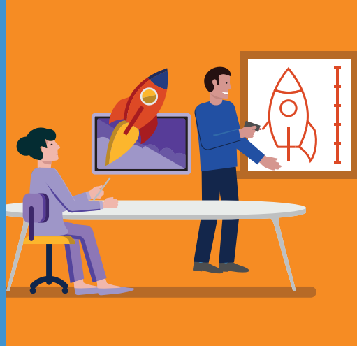
Make smarter decisions