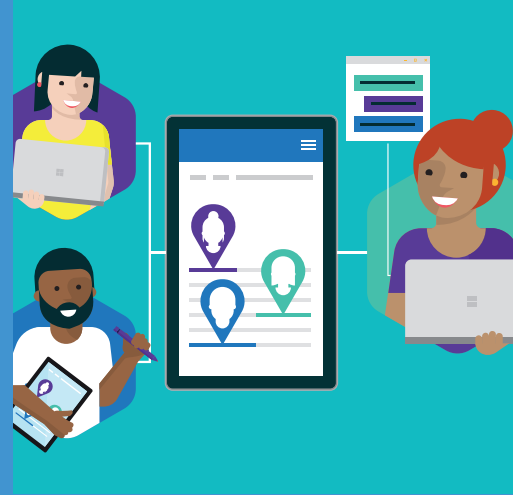
Connect your business

From day one, Microsoft Dynamics 365 Business Central makes managing financials, sales, service and operations easier and faster.